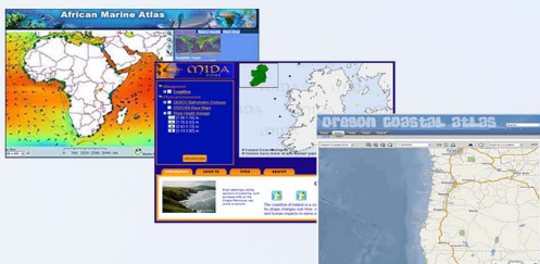
CWAs can be local, regional, national and international in scale.

We define a coastal web atlas (CWA) as: a collection of digital maps and datasets with supplementary tables, illustrations and information that systematically illustrate the coast for the purposes of coastal zone management and planning, oftentimes with cartographic and decision support tools, all of which are accessible via the Internet.