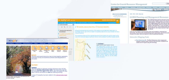
CWAs provide valuable information, data and tools for coastal zone managers and decision makers.